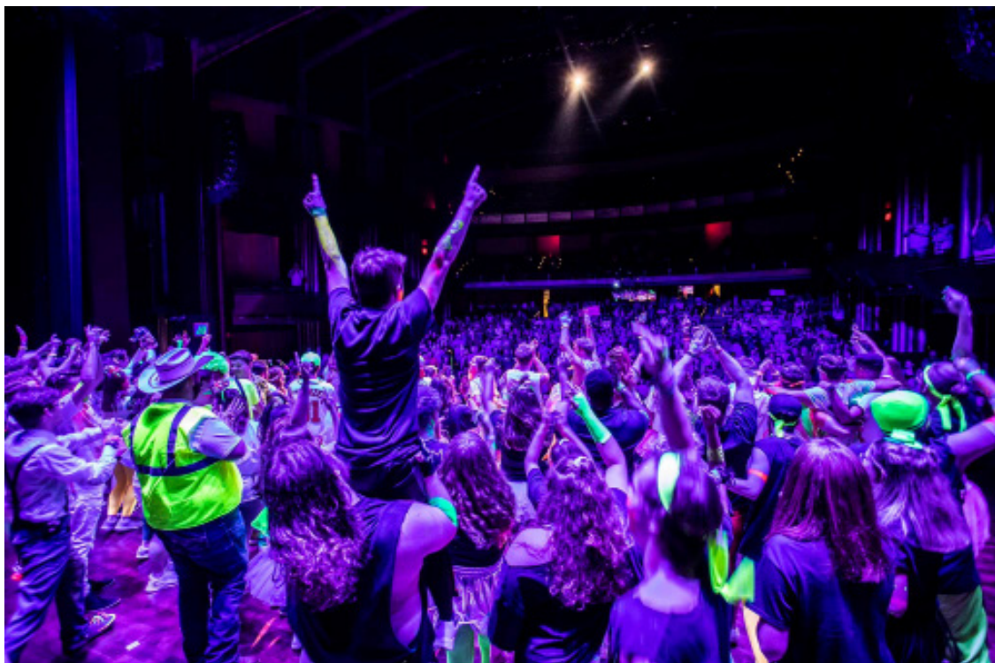
(Above) All six of CNU's a capella groups reunite on the stage for one last applause in front of an audience of over a thousand people.