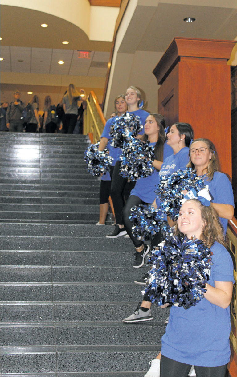
(Above) CNU Cheer cheered for the football, basketball and volleyball teams and homecoming court nominees during the Homecoming reveal and pep rally last Monday.