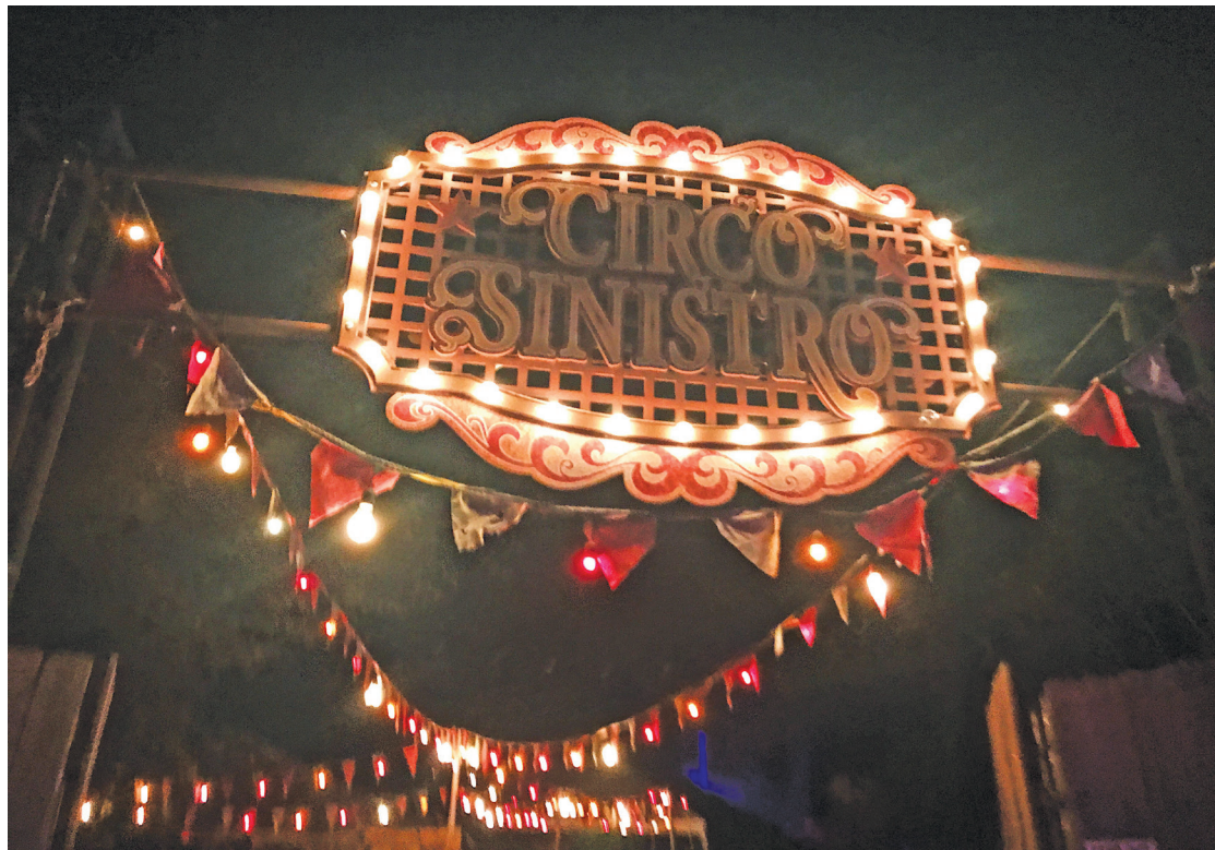
The sign for Circo Sinistro, one of Howl-O-Scream's best haunted houses, welcomes park visitors with lights and garlands.

I would definitely recommend going to Busch Gardens Howl-O-Scream. Just remember to have your head on a swivel as you never know what's lurking behind you. ■