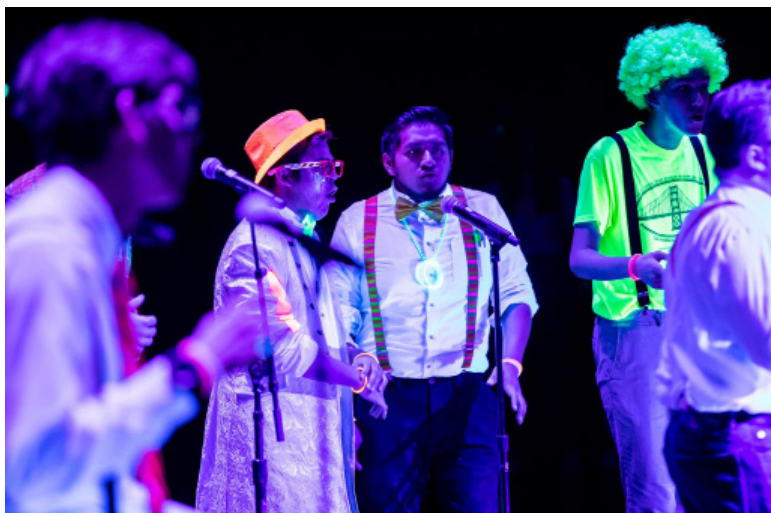
(Above) CNU's only all-male a capella group, Expansion, takes on the stage.