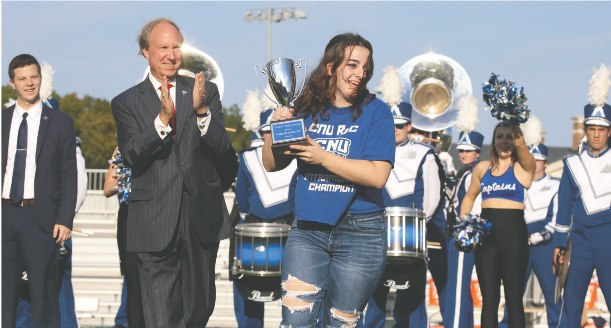
(Above) Gamma Phi Beta won the Captains cup.