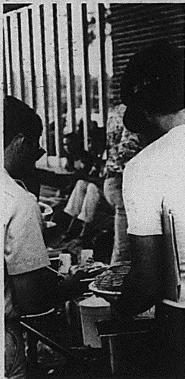
Outside luncheon highlighted Orientation.

The fall orientation for incoming CNC students proved to be very informative, and successful for all participants. Faculty humor and campus highlights which opened orienta-