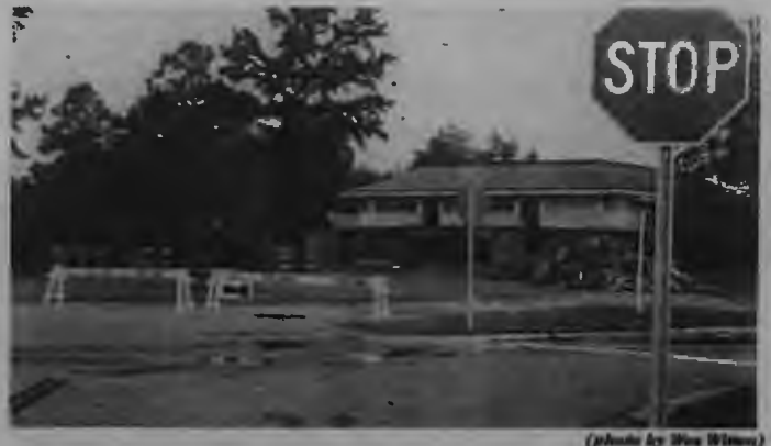
Initial construction to the Campus Center caused the front road to close and created detours.

Contract bids for the expansion will begin on August 19. Construction will begin as soon as contracts are settled. The parking lot will take approximately 30 days to construct. Realistically, the North Parking Lot Expansion should be completed by October 1, considering everything goes as planned.